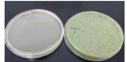
Challenge with 108cfu/ml P.a. (ATCC No. 15442) Swabbing (16 hrs. after contamination)