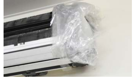
Step 3: Cover / protect electrical board.