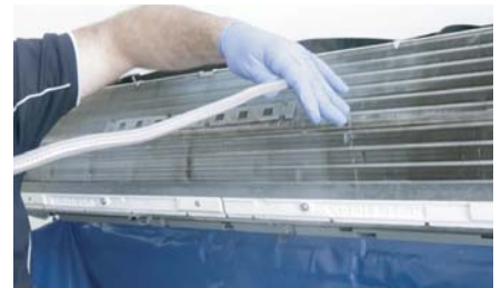
Step 9: Wash coil / barrel fan with water under light pressure.