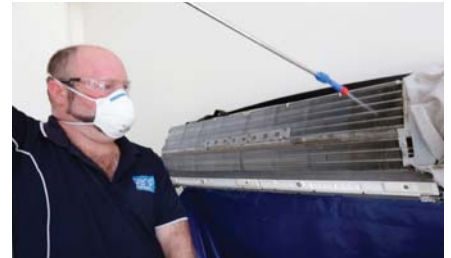
Step 6: Apply the coil cleaner and leave 15-20 mins.