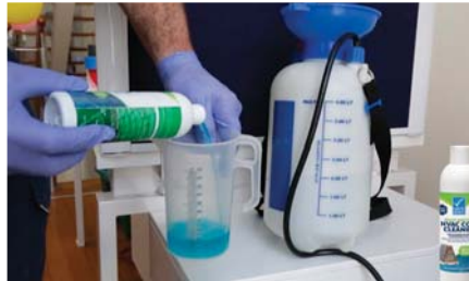
Step 5: Dilute Multi-Enzyme Coil Cleaner 50ml to 1 litre of warm water.