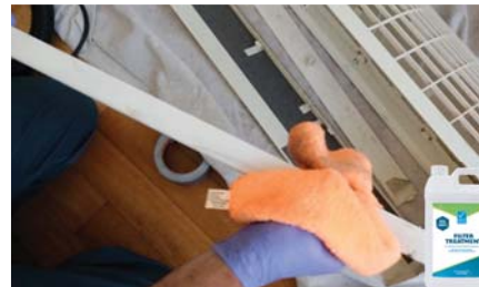
Step 8: Apply Surface Treatment to covers and Filter Treatment to filters.