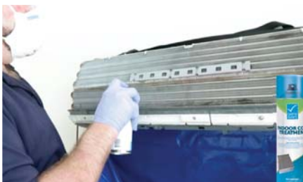
Step 10: Once dry apply Indoor Coil Treatment.