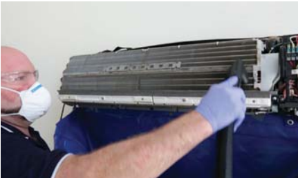
Step 4: Contact vacuum clean coil and covers.