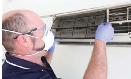
Step 2: System access preparation – Remove covers. Attach bag / bib.