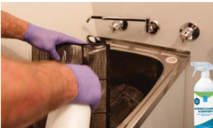
Step 7: Clean covers / filters with Surface Cleaner & Sanitiser.