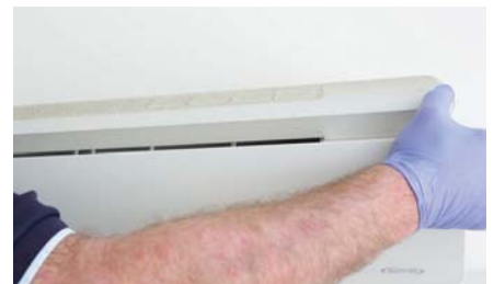
Step 12: Re-assemble unit and then restore power supply.