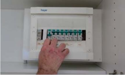
Step 1: System Assessment — Before commencing any work follow regulations and isolate power to the unit.

Please read and understand the Instructions For Use thoroughly prior to commencing work